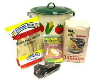
“Tamale Lovers Gift Pack”